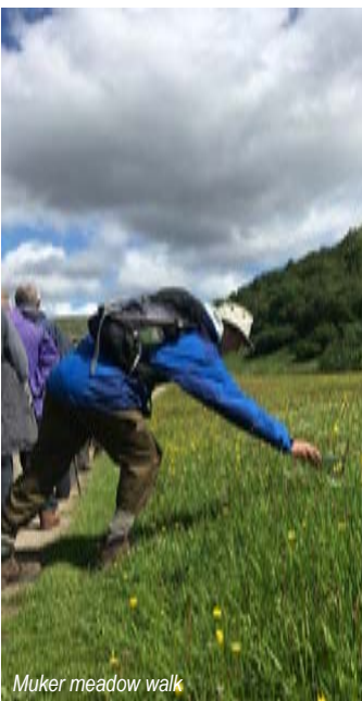
Muker meadow walk