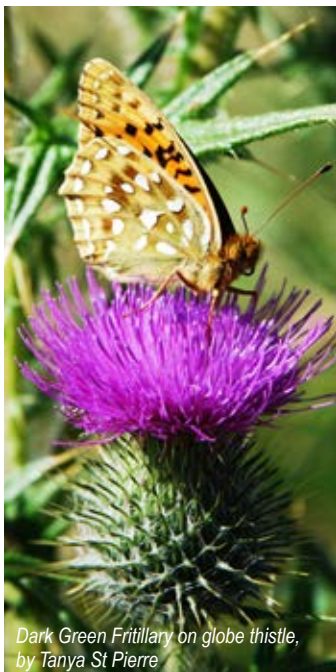
Dark Green Fritillary on globe thistle