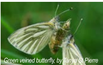
Green veined butterfly, by Tanya St Pierre