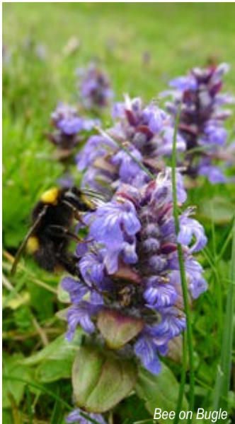
Bee on Bugle

W: www.nationaltrust.org.uk/yorkshire-dales