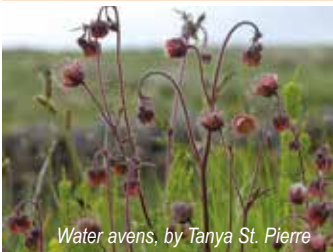
Water avens, by Tanya St. Pierre