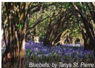
Bluebells, by Tanya St. Pierre