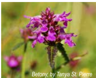
Betony, by Tanya St. Pierre