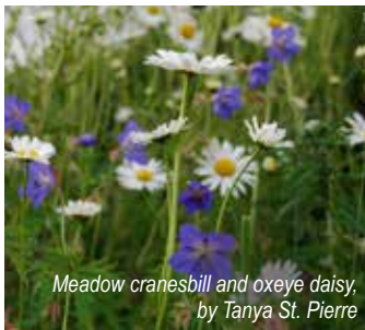
Meadow cranesbill and oxeye daisy, by Tanya St. Pierre