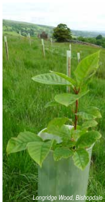
Longridge Wood, Bishopdale

W: www.field-studies-council.org/malhamtarn