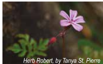
Herb Robert

W: www.field-studies-council.org/malhamtarn