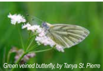
Green veined butterfly, by Tanya St. Pierre