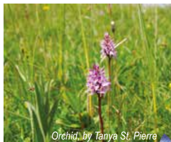
Orchid, by Tanya St. Pierre