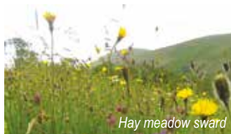
Hay meadow sward