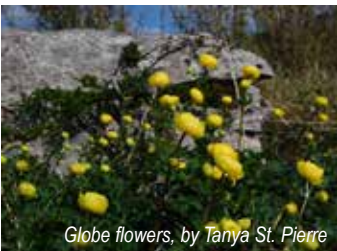
Globe flowers, by Tanya St. Pierre