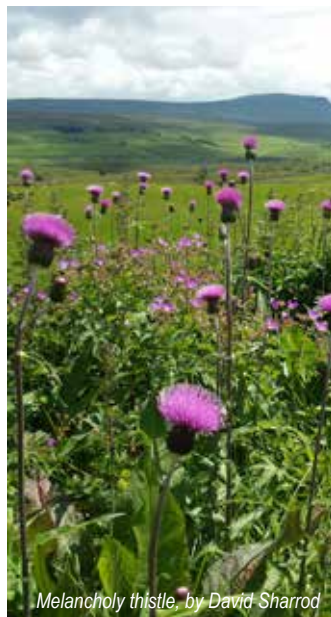
Melancholy thistle