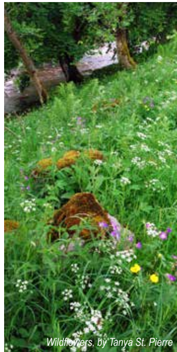
Wildflowers, by Tanya St. Pierre