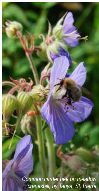
Common carder bee on meadow cranesbill

W: www.nationaltrust.org.uk/yorkshire-dales