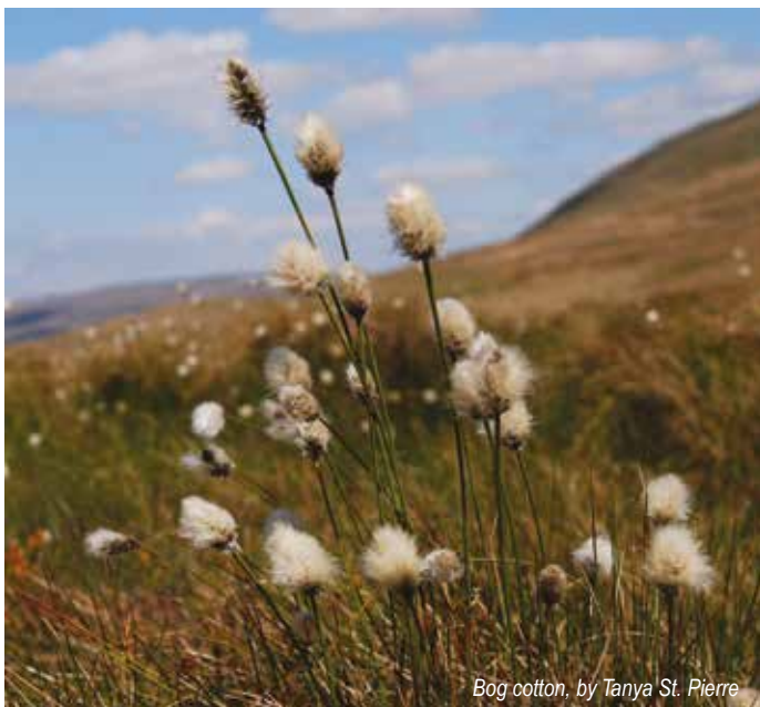
Bog cotton, by Tanya St. Pierre