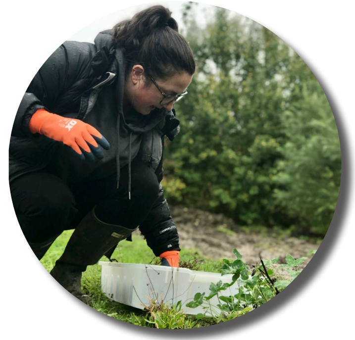
We created 10 wildlife patches for wild bees and other pollinating insects.