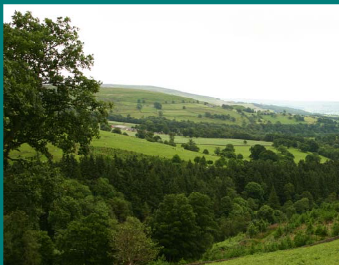
Image: Laund Oak Woodland