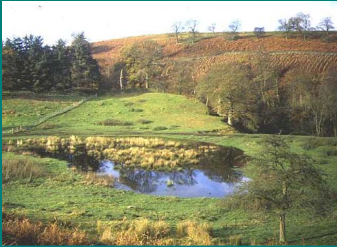
Image: Valley of Desolation