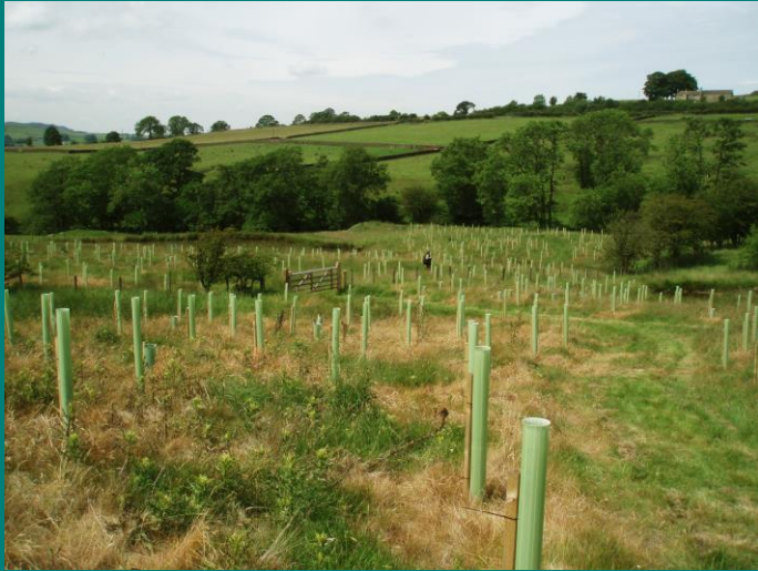
Image: Howgill Side Woodland