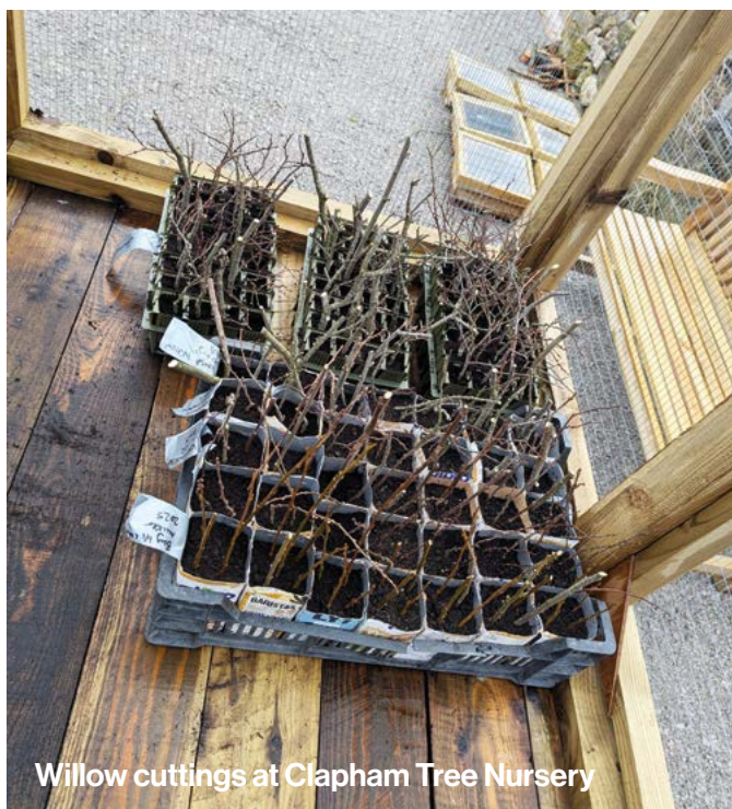
Willow cuttings at Clapham Tree Nursery

Hazel was the dominant tree across Swaledale for thousands of years, and before the introduction of oil and plastic, was a key part of the local economy and culture, and it's likely that hazel trees will have contributed to the very soil in which the new saplings were planted.