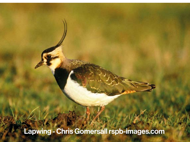
Lapwing

Partners involved in the creation of Long Preston Floodplain Project, including the farmers who privately own the land, as well as Natural England, Ribble Rivers Trust, Environment Agency, RSPB, North Yorkshire Council, North Yorkshire York Local Nature Partnership and the Yorkshire Dales National Park Authority attended an event at Lords Courtyard, Settle to reflect on the achievements of the last twenty years.