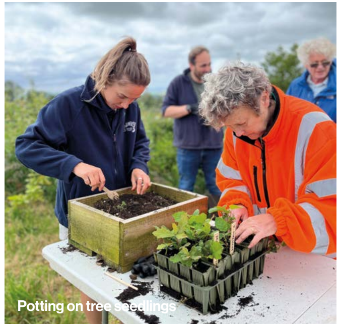
Potting on tree seedlings

The Seed to Sapling project is helping to ensure the right trees are available to plant in the Dales by creating community tree growing schemes where native saplings are grown from local provenance seed. This helps strengthen our efforts to develop a landscape richer in trees, woods and hedgerows, with tree cover of varying types and densities planted using locally grown stock from across the national park.